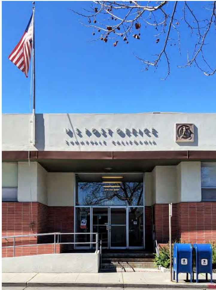
Detail facing west of main entrance. February, 2018