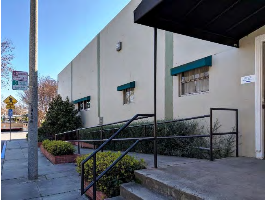
View facing east of side entrance on north side elevation. February, 2018.

*Recorded by Leslie Dill & Franklin Maggi *Date 05/01/2018 Continuation Update