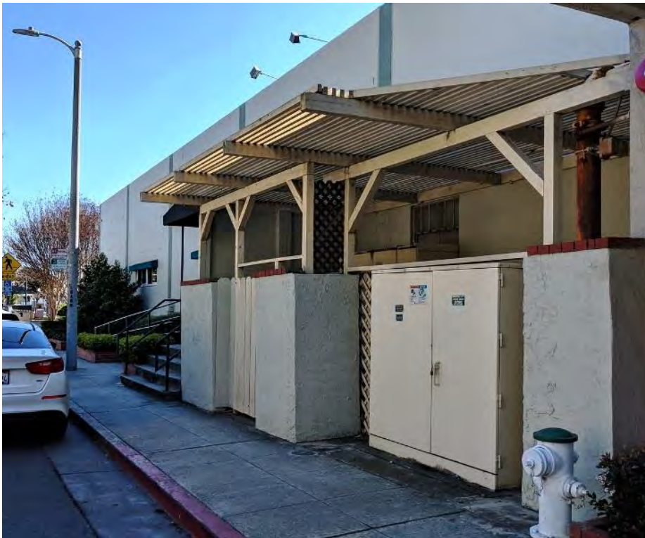
View facing southeast of north side rear utility area. February, 2018.