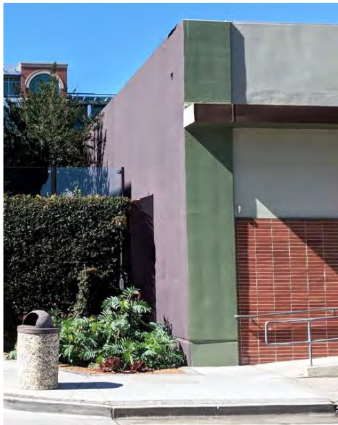
View looking west of south elevation. February 2018.