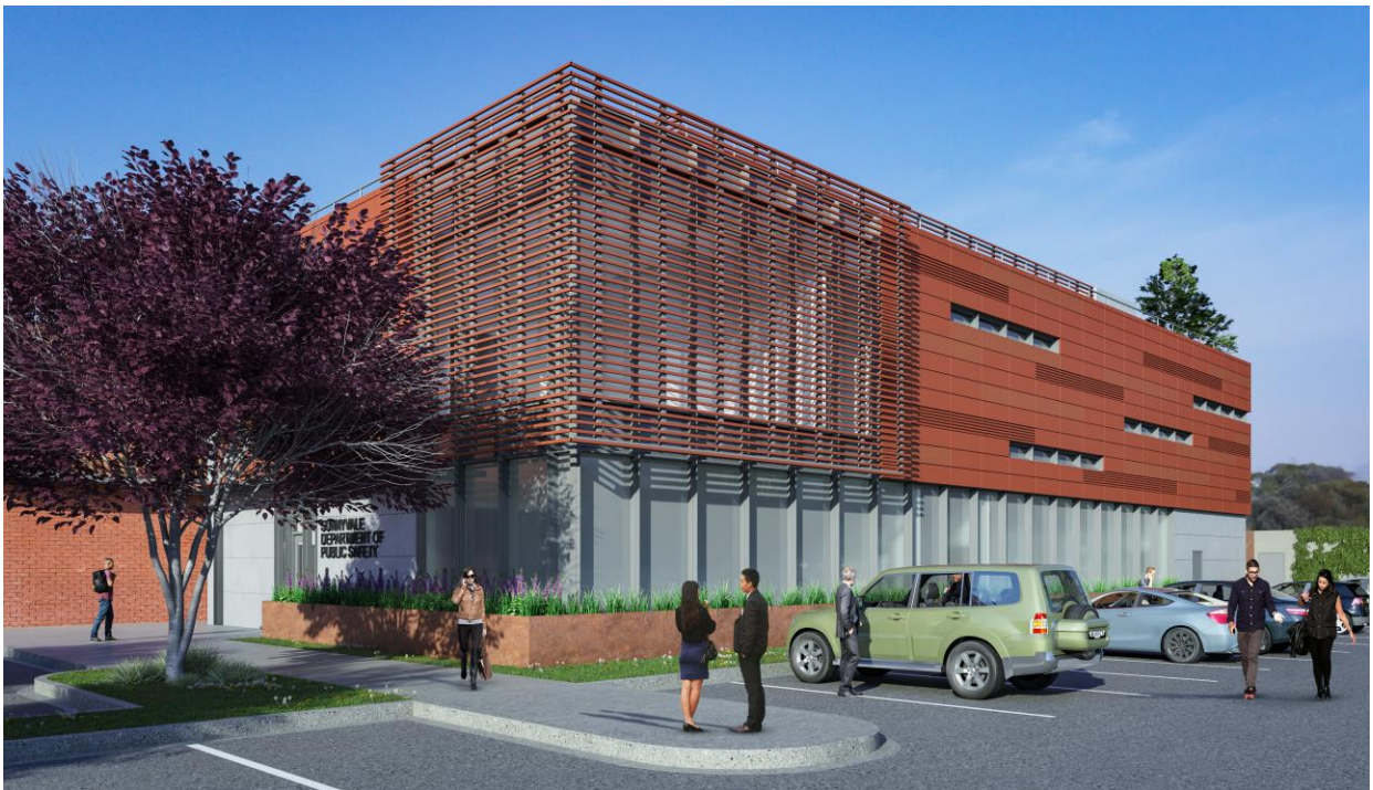
New Emergency Operations Center