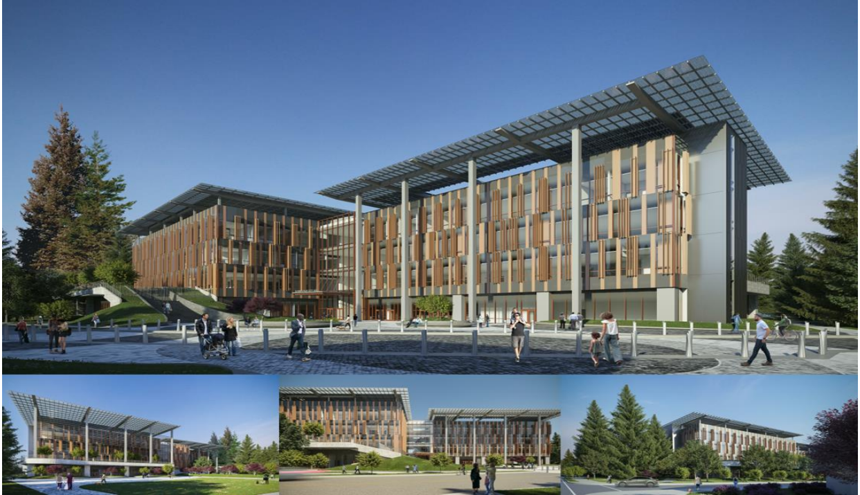
New City Hall

All other parking restrictions, including no parking for street cleaning, will still be in effect. The City's Construction Management team will be working to minimize any impact but expect a few traffic delays during construction. For additional information, please visit the project's webpage at https://sunnyvale.ca.gov/business/projects/civic.htm . We thank you in advance for your cooperation and support of this project.