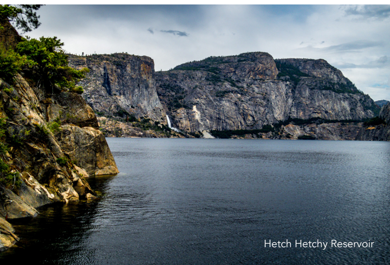
Hetch Hetchy Reservoir

Visit waterboards.ca.gov/drinking_water/certlic/drinkingwater/DWSAP.html for more information, or call (408) 730-7400 to schedule a time to view the City's DWSAP.